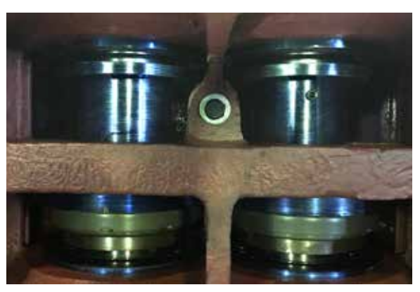
Components (main shafts) for palm oil extract